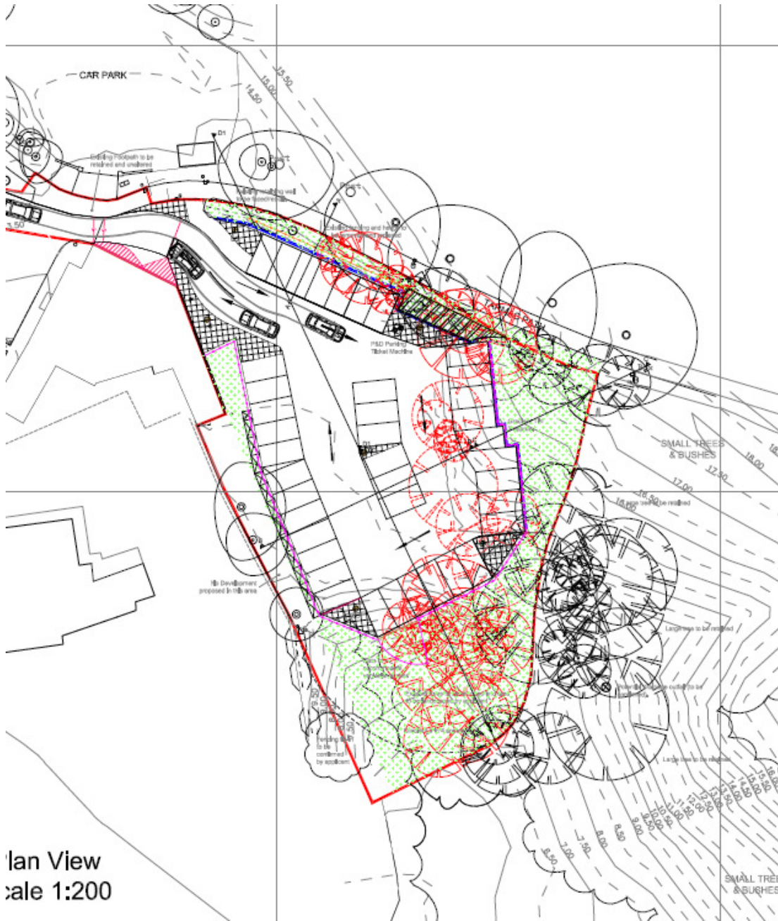
Plan View Scale 1:200